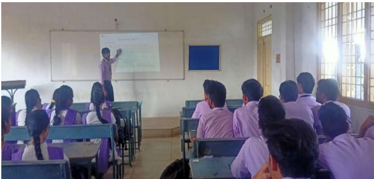
Fig.3 Student explaining the concept of Capacitance