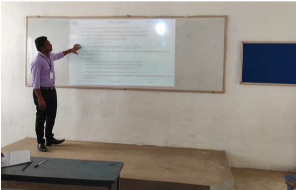
Fig.1 Student explaining the concept of conductors

About the Course: This course is specially designed for III Semester students. This will give the students to analyze the behavior of conductors, dielectrics and capacitors. They will get to know about the behavior of conductors in an electric field. They will eventually gain an understanding the concepts of Dielectric & Capacitance.