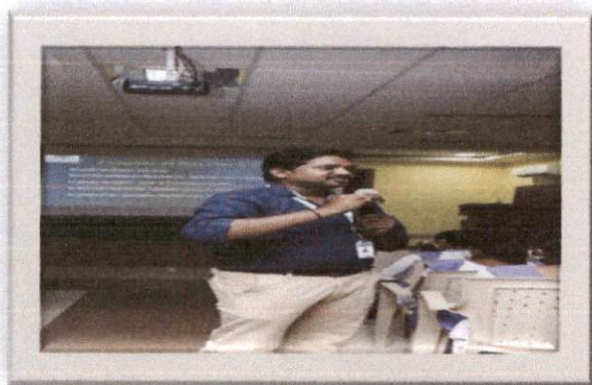
Deliver Lecture on 25-06-2018