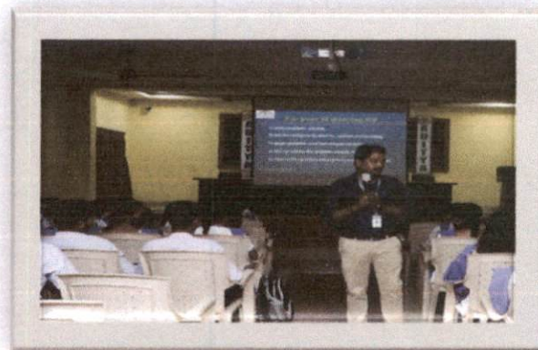
Interaction Session on 25-06-2018