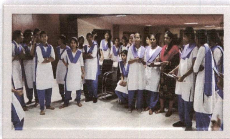
Activity Session on 25-06-2018