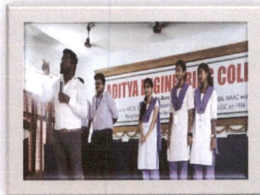
Activity Session on 27-04-2021