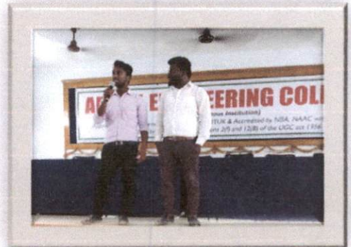
Activity Session on 27-04-2021