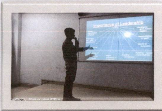
Presentation Session on 26-04-2021